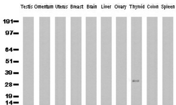
Western Blot analysis of 10 different human tissue lysates (10ug) by using anti-CD20 monoclonal antibody (clone UMAB38, 1:500)