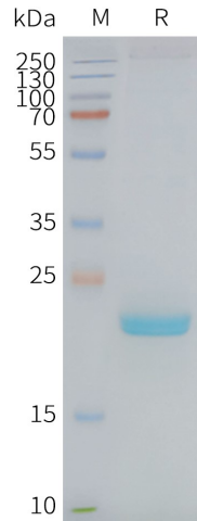
Figure 2. Human CLDN4-Nanodisc, Flag Tag on SDS-PAGE

Protein Pathways: Cell adhesion molecules (CAMs), Leukocyte transendothelial migration, Tight junction