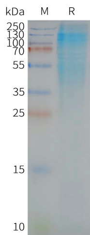
Figure 2. Human CD37-Nanodisc, Flag Tag on SDS-PAGE

Protein Pathways: Hematopoietic cell lineage