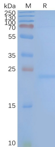
Figure 2. Human TM4SF1-Nanodisc, Flag Tag on SDS-PAGE