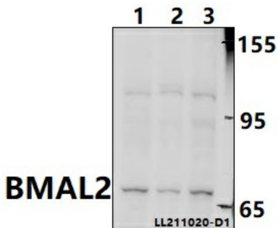
Western blot (WB) analysis of BMAL2 polyclonal antibody at 1:2000 dilution Lane1:A549 whole cell lysate(40ug) Lane2:U-87MG whole cell lysate(40ug) Lane3:PC3 whole cell lysate(40ug)