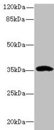
Western blot All lanes: CCDC24 antibody at 6µg/ml + MCF-7 whole cell lysate Secondary Goat polyclonal to rabbit IgG at 1/10000 dilution Predicted band size: 35, 31 kDa Observed band size: 35 kDa