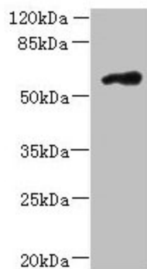
Western blot All lanes: FAM126B antibody at 7 \mu g/ml + A431 whole cell lysate Secondary Goat polyclonal to rabbit IgG at 1/10000 dilution Predicted band size: 59 kDa Observed band size: 59 kDa