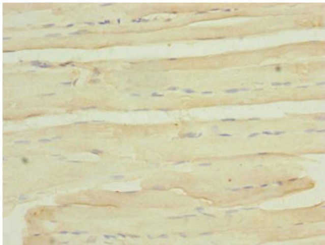
Immunohistochemistry of paraffin-embedded human skeletal muscle tissue using [TA388300] at dilution of 1:100