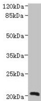
Western blot All lanes: NICN1 antibody at 4 \mu g/ml + U937 whole cell lysate Secondary Goat polyclonal to rabbit IgG at 1/10000 dilution Predicted band size: 25, 20 kDa Observed band size: 20 kDa