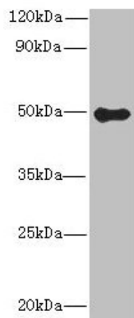
Western blot All lanes: GSDMB antibody at 8µg/ml + Colo320 whole cell lysate Secondary Goat polyclonal to rabbit IgG at 1/10000 dilution Predicted band size: 47, 46, 48, 19 kDa Observed band size: 47 kDa