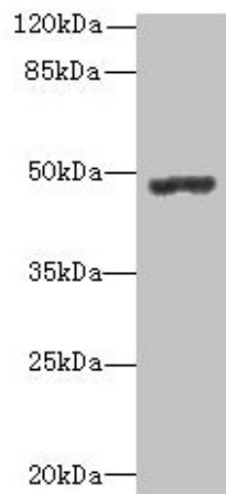
Western blot All lanes: PSG3 antibody at 10µg/ml + HepG2 whole cell lysate Secondary Goat polyclonal to rabbit IgG at 1/10000 dilution Predicted band size: 48 kDa Observed band size: 48 kDa