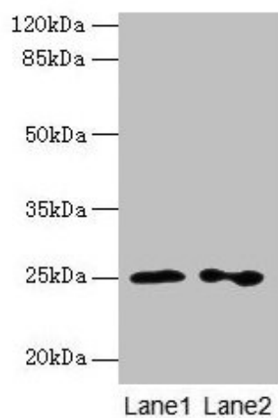
Western blot All lanes: RAB11B antibody at 2 \mu g/ml Lane 1: Hela whole cell lysate Lane 2: Rat gonadal tissue Secondary Goat polyclonal to rabbit IgG at 1/10000 dilution Predicted band size: 25, 20 kDa Observed band size: 25 kDa