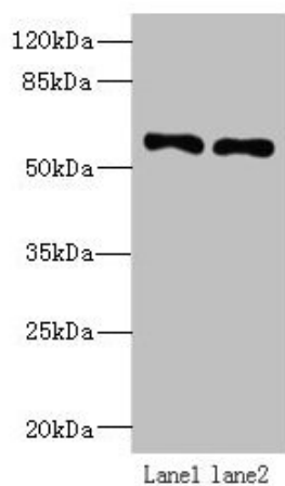
Western blot All lanes: IFRD2 antibody at 12 \mu g/ml Lane 1: Hela whole cell lysate Lane 2: PC-3 whole cell lysate Secondary Goat polyclonal to rabbit IgG at 1/10000 dilution Predicted band size: 55, 66 kDa Observed band size: 55 kDa