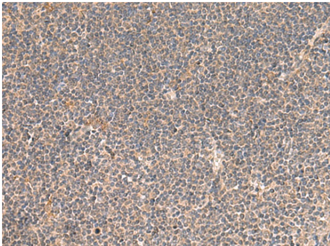
Immunohistochemistry of paraffin-embedded Human tonsil tissue using [TA370544] (KCNE3 Antibody) at dilution 1/55 (Original magnification: ×200)