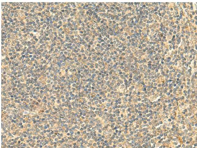
Immunohistochemistry of paraffin-embedded Human tonsil tissue using TA366198 (NTAN1 Antibody) at dilution 1/50 (Original magnification: ×200)