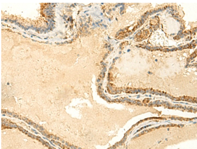
Immunohistochemistry of paraffin-embedded Human thyroid cancer tissue using TA366198 (NTAN1 Antibody) at dilution 1/50 (Original magnification: ×200)