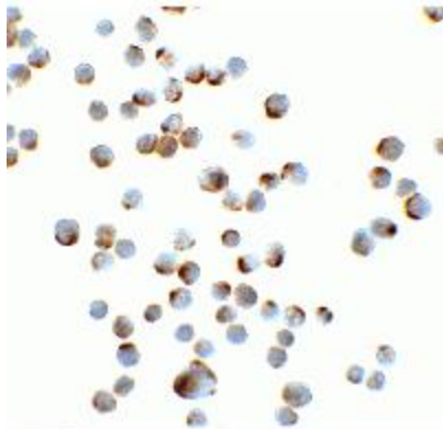
Immunocytochemistry of GAPDH in HeLa cells with GAPDH antibody at 5ug/ml.