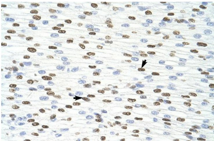
Rabbit Anti-HNRPD Antibody; Paraffin Embedded Tissue: Human Heart; Cellular Data: Myocardial cells; Antibody Concentration: 4.0-8.0 ug/ml; Magnification: 400X