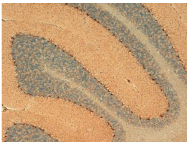
IHC analysis of HCN1 using the antibody