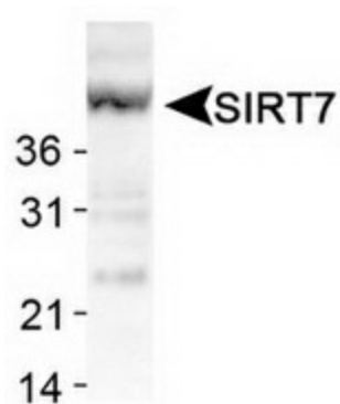
Detection of SIRT7 in human liver lysates using TA309860.