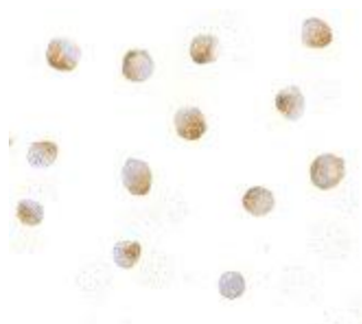
Immunocytochemistry of DFF40 in Jurkat cells with DFF40 antibody at 5 ug/mL.