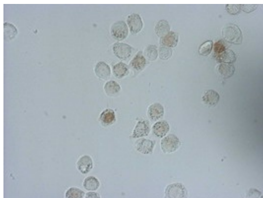
Immunocytochemistry staining of HT-29 cells pulsed with 5-iodo-2'-deoxyuridine (IdU) using mouse monoclonal anti-IDU antibody (1:150)