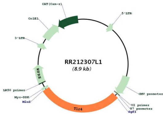
Circular map for RR212307L1