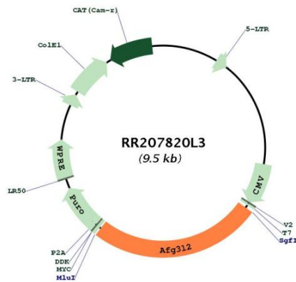
Circular map for RR207820L3