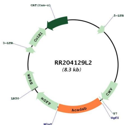
Circular map for RR204129L2