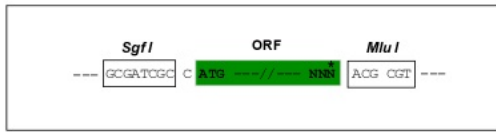
Cloning sites used for ORF Shutting: