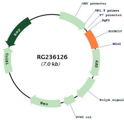
Circular map for RG236126