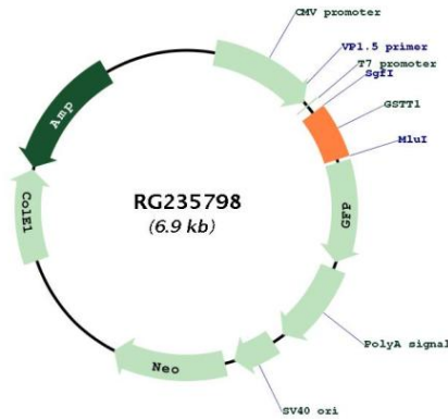
Circular map for RG235798