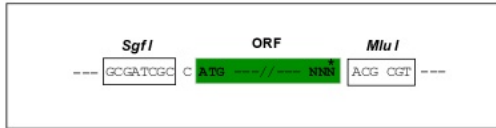
Cloning sites used for ORF Shutting: