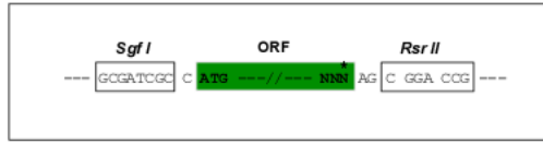
Cloning sites used for ORF Shuttling: