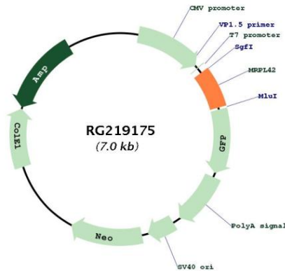
Circular map for RG219175