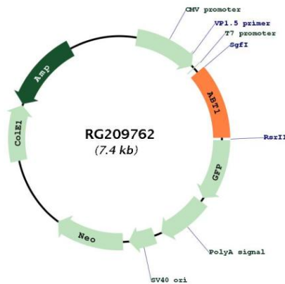
Circular map for RG209762