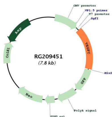
Circular map for RG209451