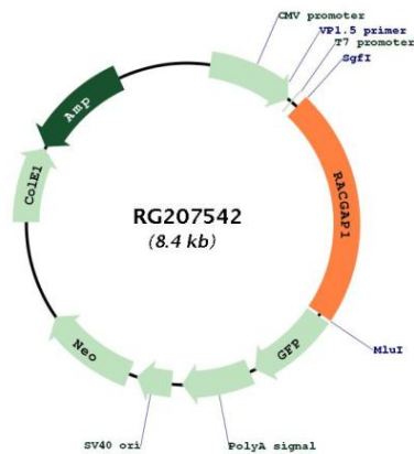
Circular map for RG207542