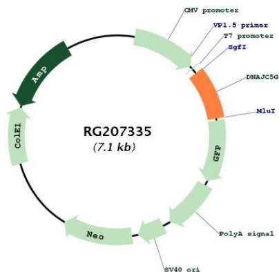
Circular map for RG207335