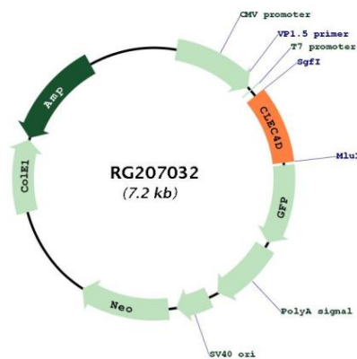
Circular map for RG207032