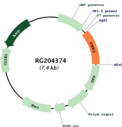
Circular map for RG204374