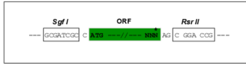
Cloning sites used for ORF Shuttling: