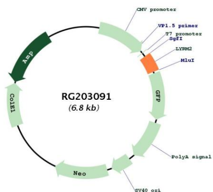
Circular map for RG203091