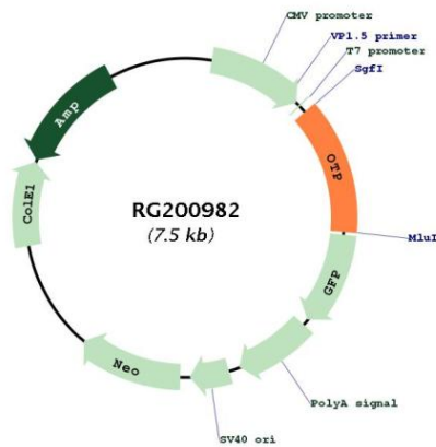
Circular map for RG200982