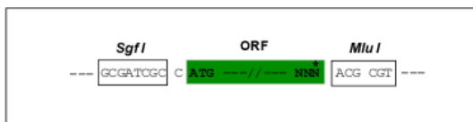
Cloning sites used for ORF Shutting: