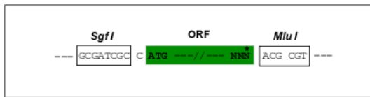
Cloning sites used for ORF Shutting: