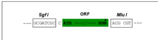
Cloning sites used for ORF Shutting: