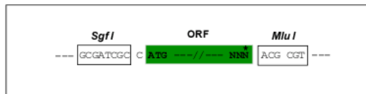
Cloning sites used for ORF Shutting: