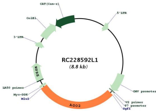
Circular map for RC228592L1