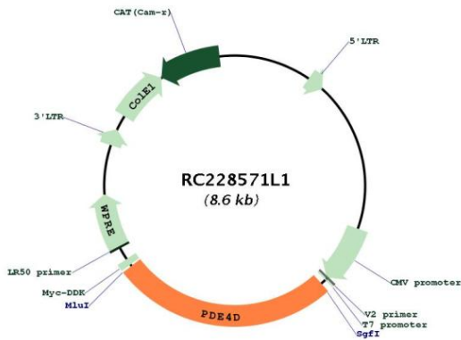
Circular map for RC228571L1