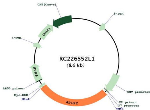
Circular map for RC226552L1