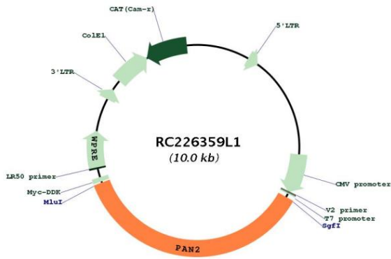
Circular map for RC226359L1