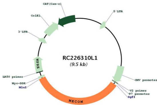
Circular map for RC226310L1