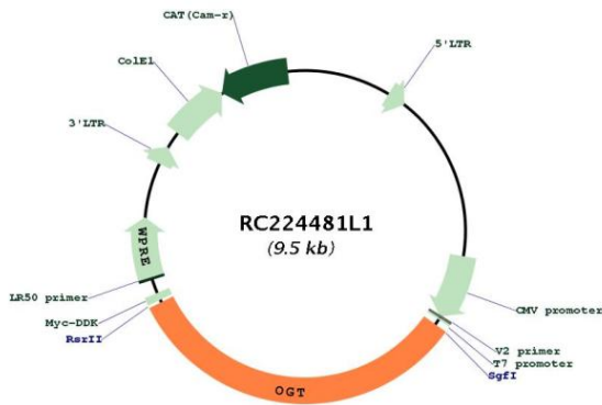
Circular map for RC224481L1