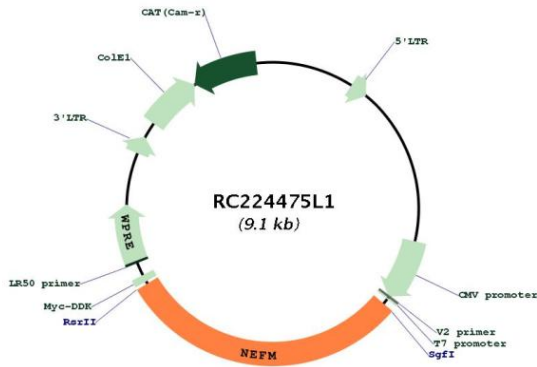
Circular map for RC224475L1